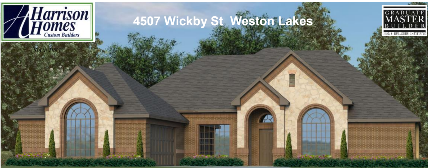
Artist rendering. Not exact colors

Floor plan & elevation may not be exact. Price is subject to change without prior notice. Plans are the property of Harrison Homes.